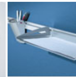
Puebla accessory rail

Thanks to the choice of desktop shapes available in the Hotline range, configurations can be linear or star-shaped, with two to six units in each or even more if required. The perfect choice of furniture for busy call centres.