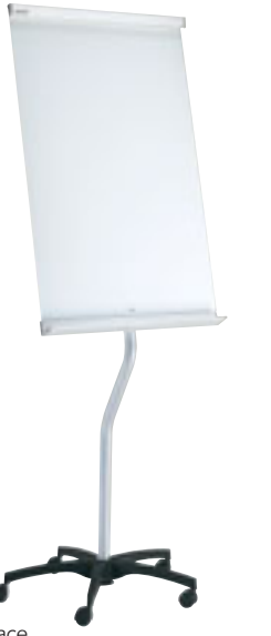
Mobile flipchart easel Lacquered sheet steel surface.