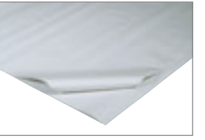
Flipchart pad Set of 5 paper rolls.