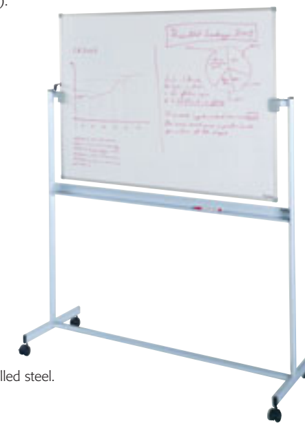
Mobile whiteboard Double-sided board in enamelled steel.