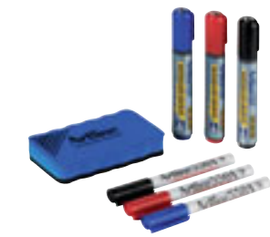
Accessory kit For whiteboards.