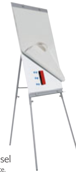
Flipchart easel Lacquered surface.