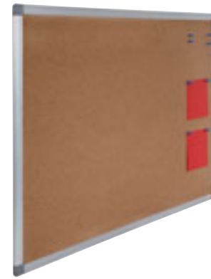
Natural cork board Available in 3 sizes.