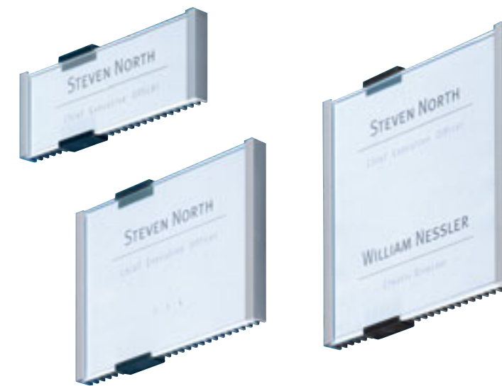
Identification plates For attachment to doors or for giving directions. A stylish, modular range with aluminium mounts. Available in a choice of sizes. Quick and easy to fit using the screws or adhesive supplied.