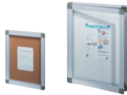
Window boards Board surface in compressed cork or grey lacquered sheet steel. Available in 4 or 9 sheet versions.