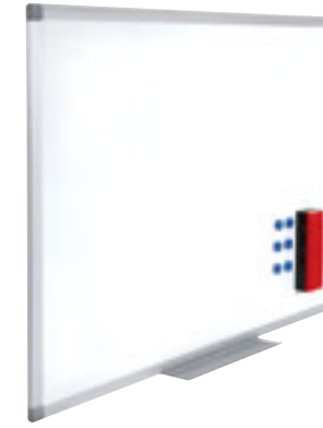
Whiteboards Made from enamelled sheet steel (4 sizes) or lacquered sheet steel (2 sizes).