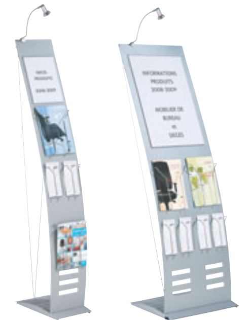
Metal display boards To add the finishing touch to your signage. Available in two sizes and suitable for signs as well as documents.

For prices, optional extras and technical specifications, see separate price guide, pages 115 to 116.